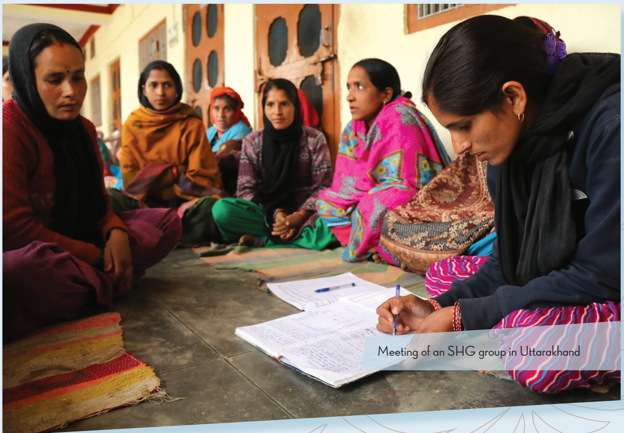
Meeting of an SHG group in Uttarakhand

Empowerment through loans is also facilitated to individual members to promote community growth.