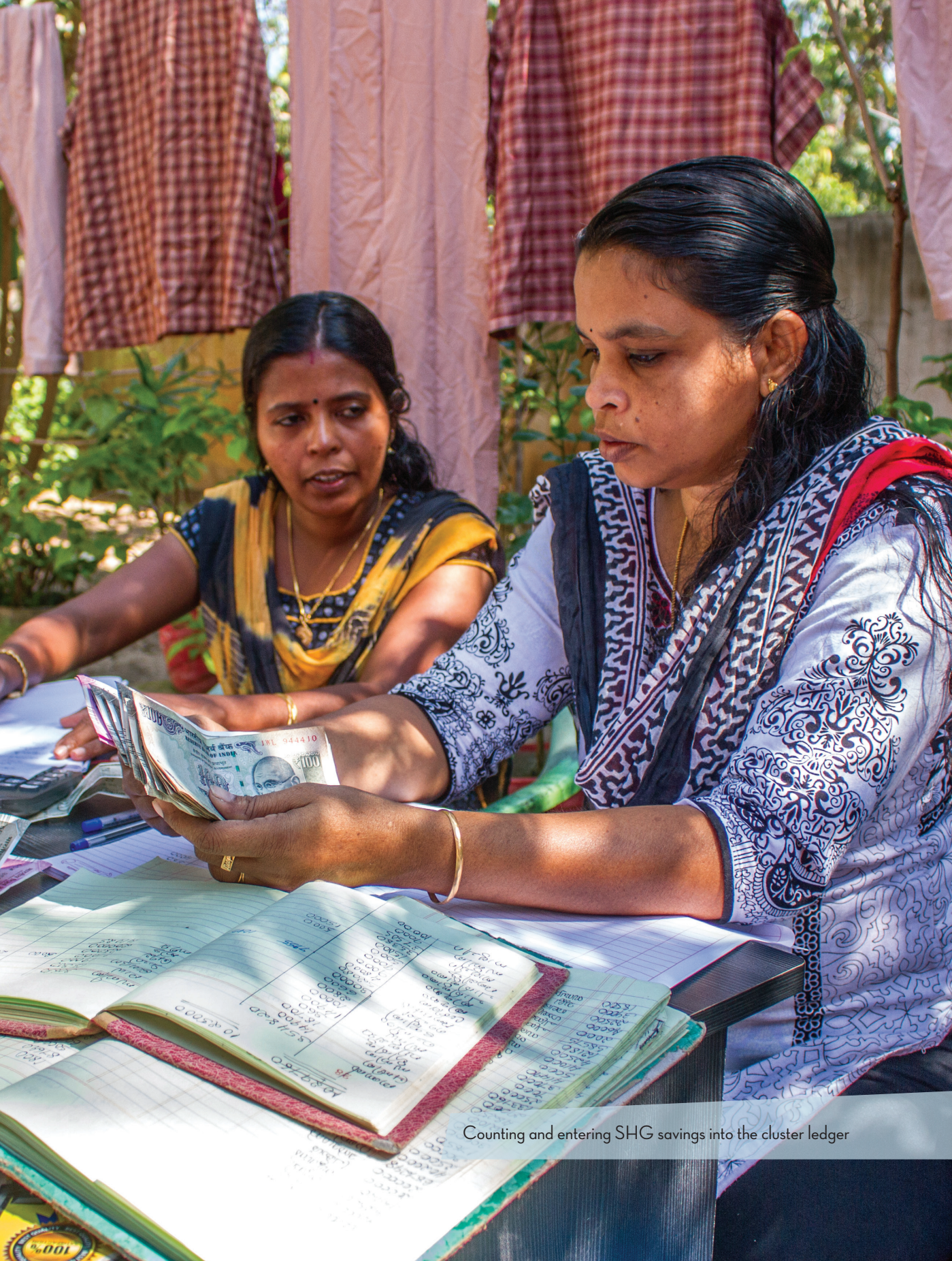
Counting and entering SHG savings into the cluster ledger