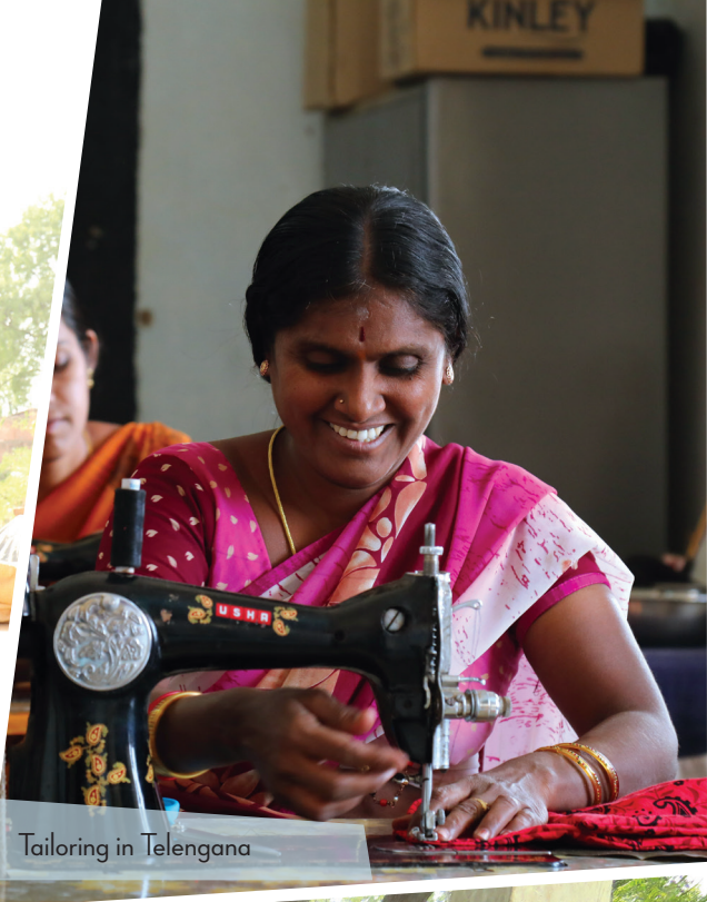
Tailoring in Telengana