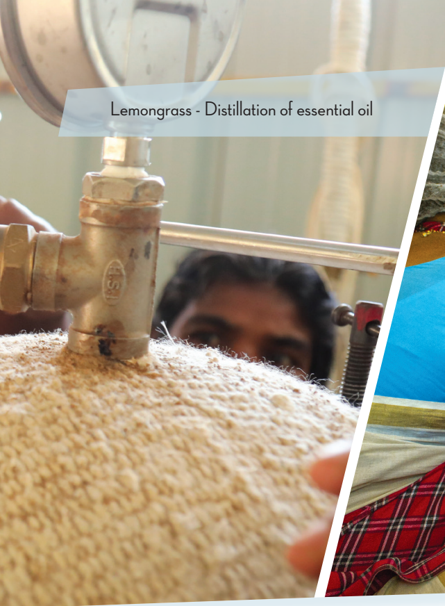
Lemongrass - Distillation of essential oil