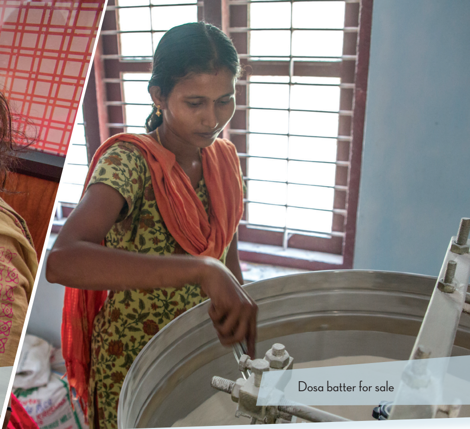
Dosa batter for sale

the greatest security, for it can always be pawned. Gold is also given for a new baby. It is considered an essential collateral.