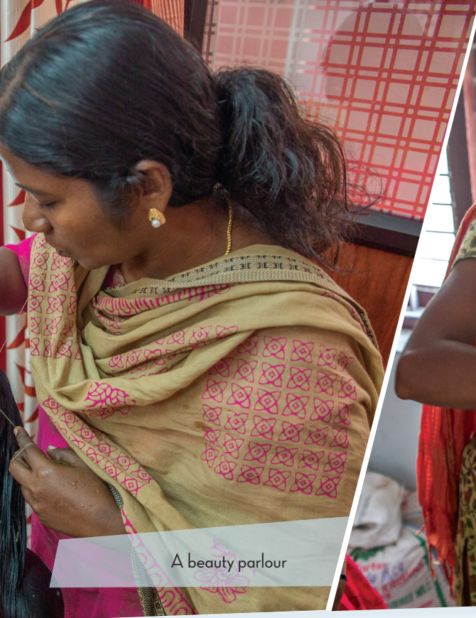
A beauty parlour