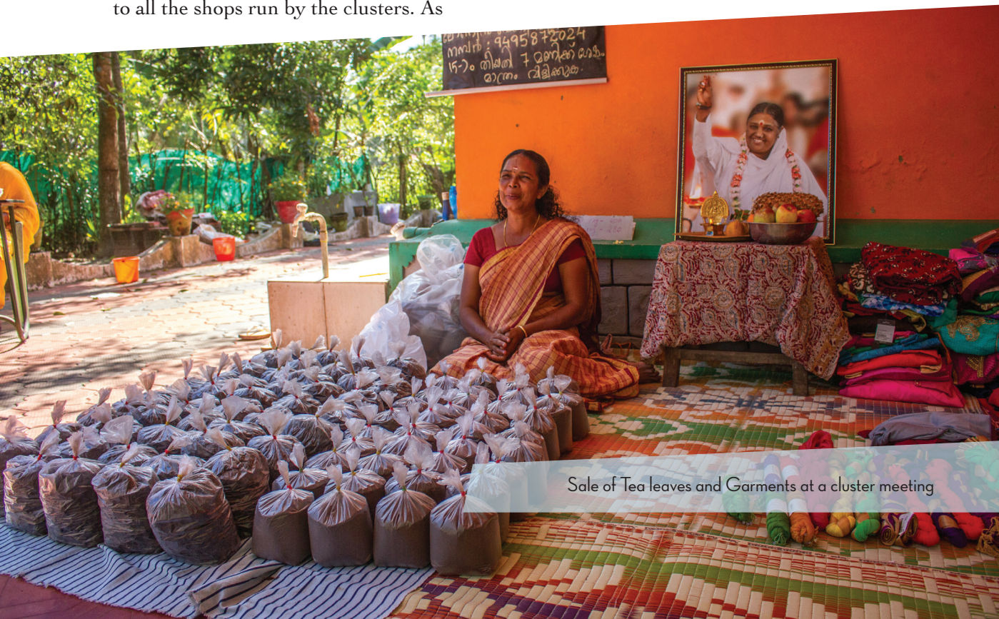
Sale of Tea leaves and Garments at a cluster meeting

The Amriteshwari AmritaSREE SHG started in 2008 with 12 members. Members collect coconuts from neighbouring areas, dehusk them and then sell them to individuals and grocery shops. The turnover is about six lakhs per month. Now the business makes Rs. 50,000 net profit per month.