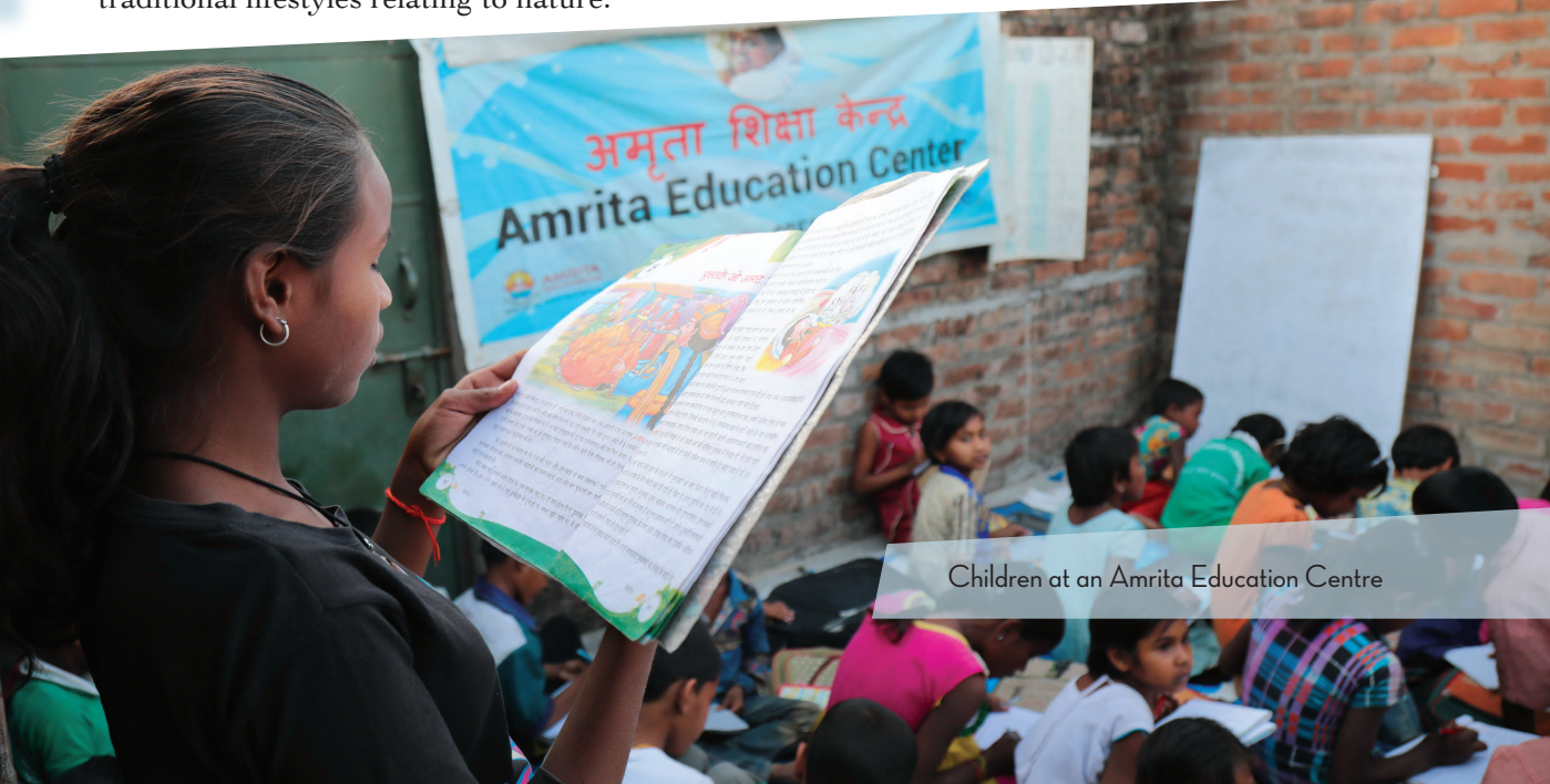
Children at an Amrita Education Centre

Amma's will has traversed many landscapes already bringing about phenomenal changes to the situation of women in rural India. Much has been achieved, but there is much more on her agenda. Amma feels that it is imperative that the women of rural India should be made aware of the unlimited potential that rests within them, for they run the family. Family is of immense consequence in the Indian way of life. There is a lot that these women can achieve together; for themselves, their families, the nation and ultimately for this world.