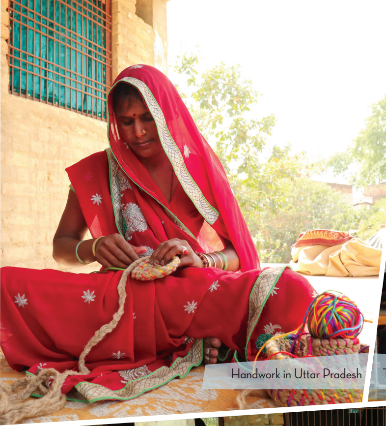
Handwork in Uttar Pradesh