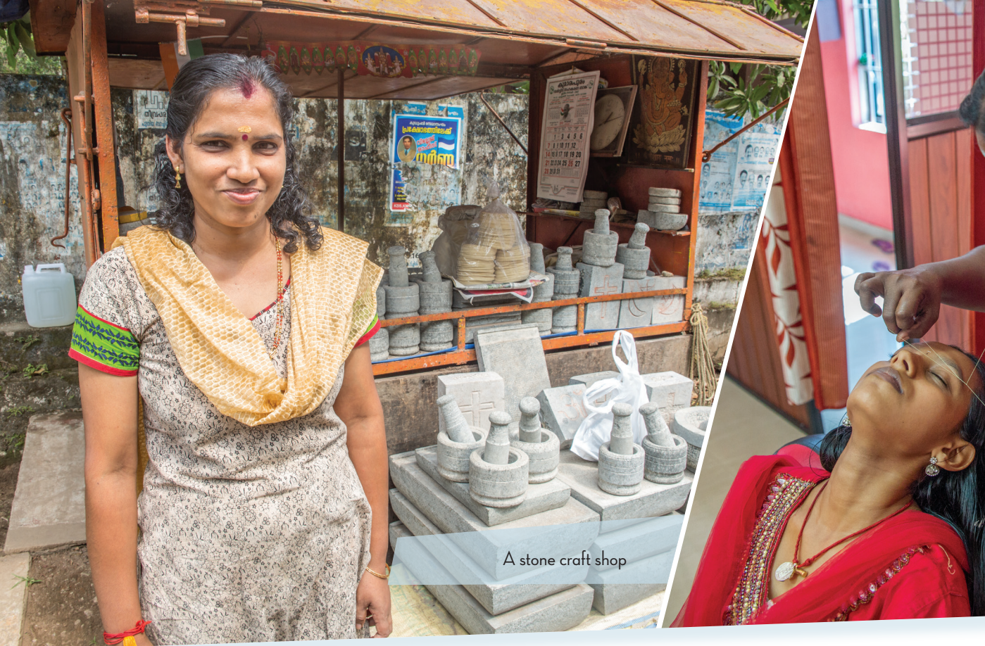
A stone craft shop

The AmritaSREE Self-Help Group Program is a cardinal step towards enriching and enhancing women; in a sense it is verily the celebration of the power of women collective.