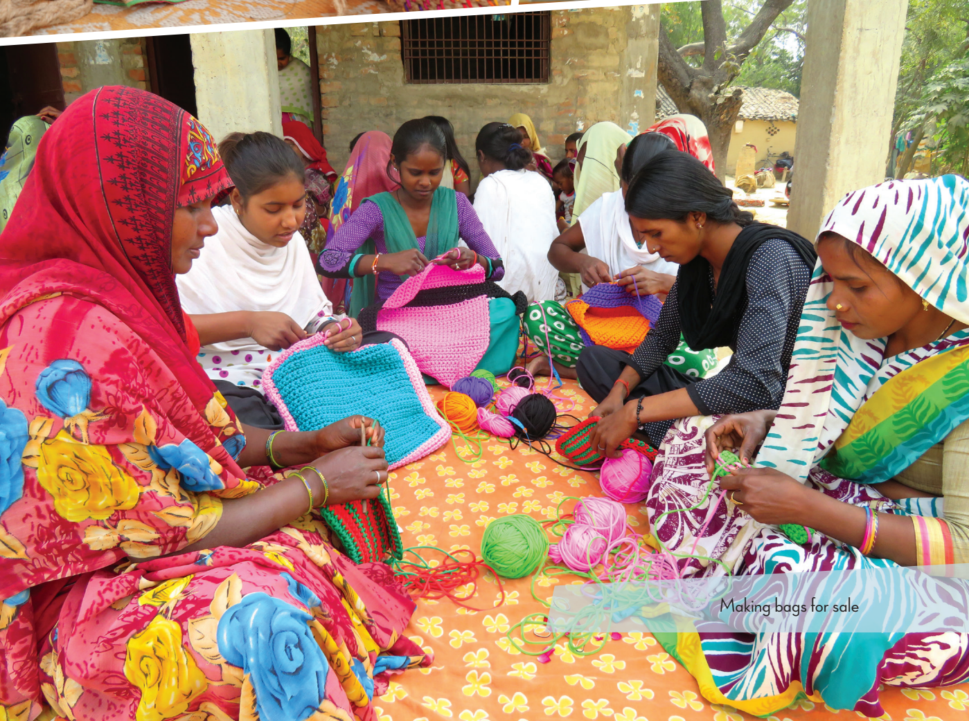
Making bags for sale