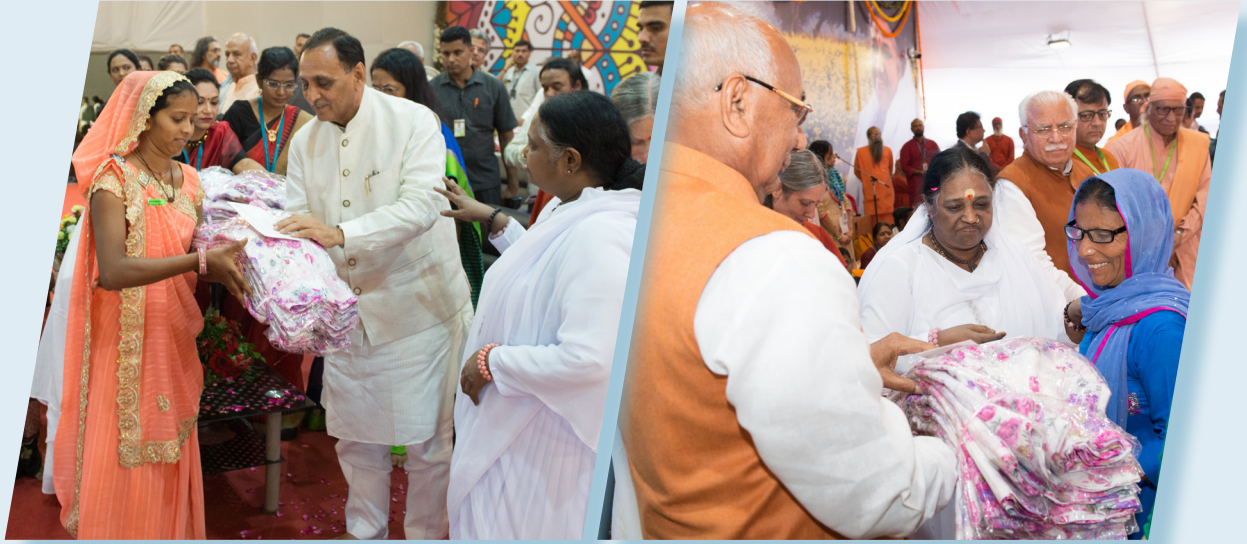
Amma distributing sarees and seed money of Rs. 30,000 as grant for each AmritaSREE SHG during her public programmes held in various states. The left photograph was taken with the honourable Chief Minister of Gujarat, Vijay Rupani, and the right one with the honourable Governor, Prof Kaptan Singh Solanki (front left), and the honourable Chief Minister, Manohar Lal Khattar (near Amma on the right), of Haryana. The seed money can be utilized either as working capital or as an addition to the corpus fund of each SHG.