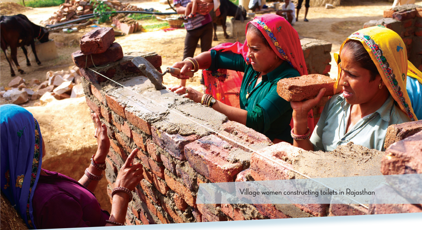
Village women constructing toilets in Rajasthan