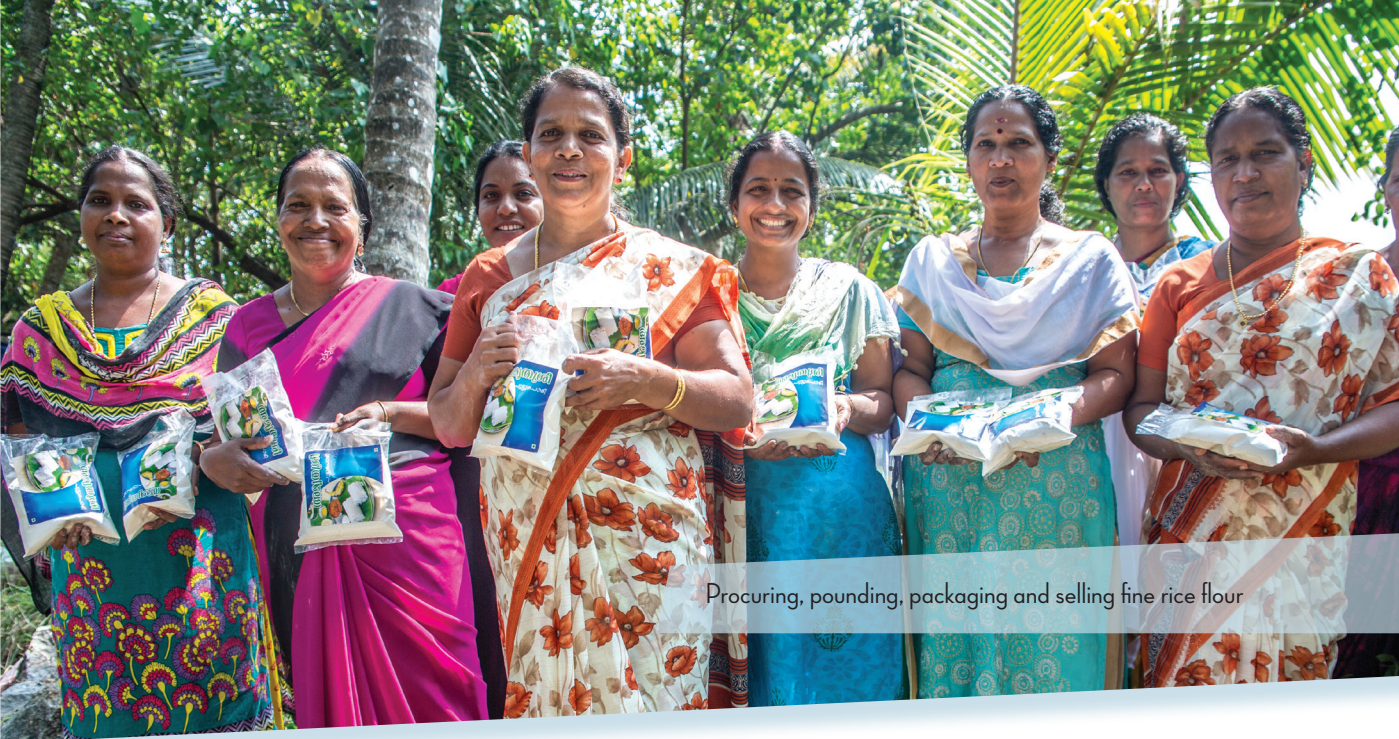
Procuring, pounding, packaging and selling fine rice flour