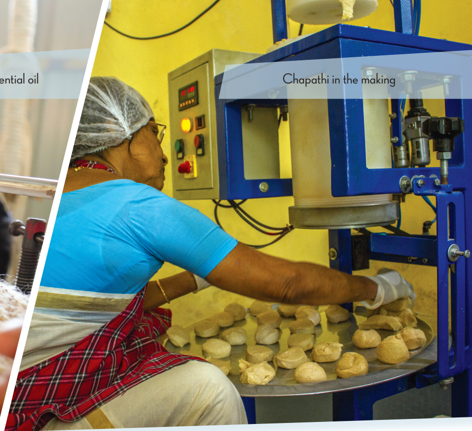
Chapathi in the making