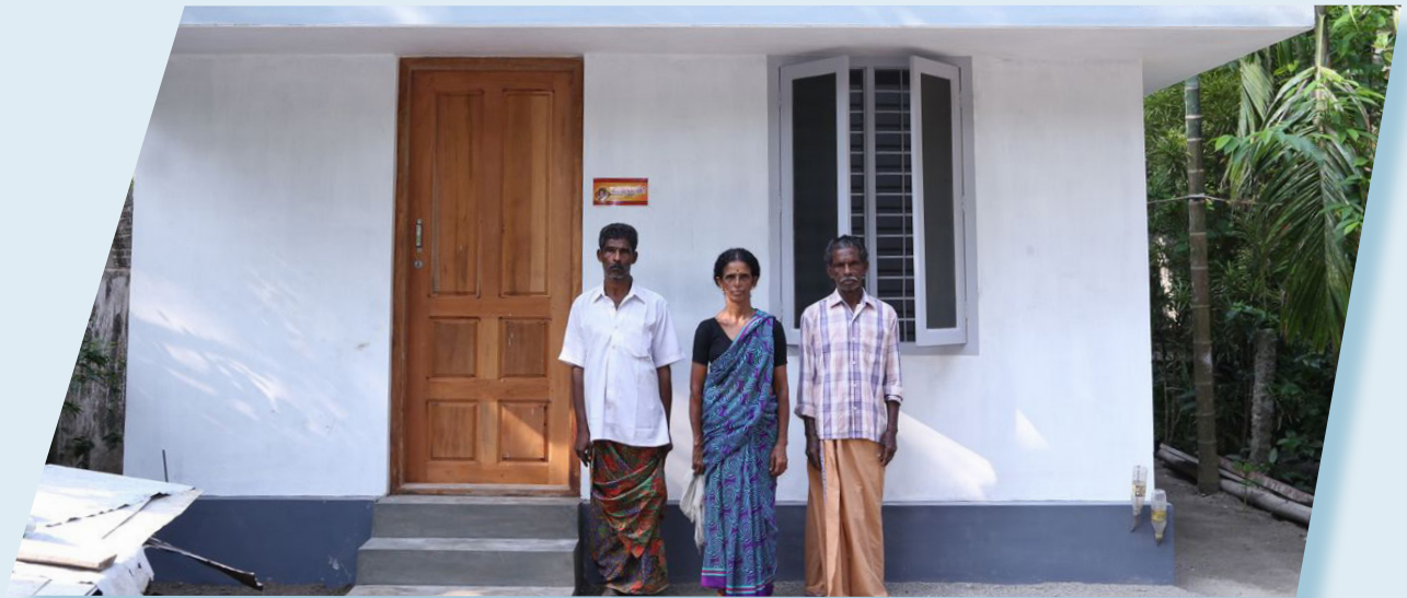
“Service to mankind is service to God.” Inspired by Amma’s vision, the AmritaSREE Clusters are keeping aside a portion of the interest earned from their savings to build homes for the homeless. The Kuttanadu cluster in Kerala handed over one of the three homes already built to a homeless family. In total, seventy-six clusters have pledged to give one home each for the homeless among their members.