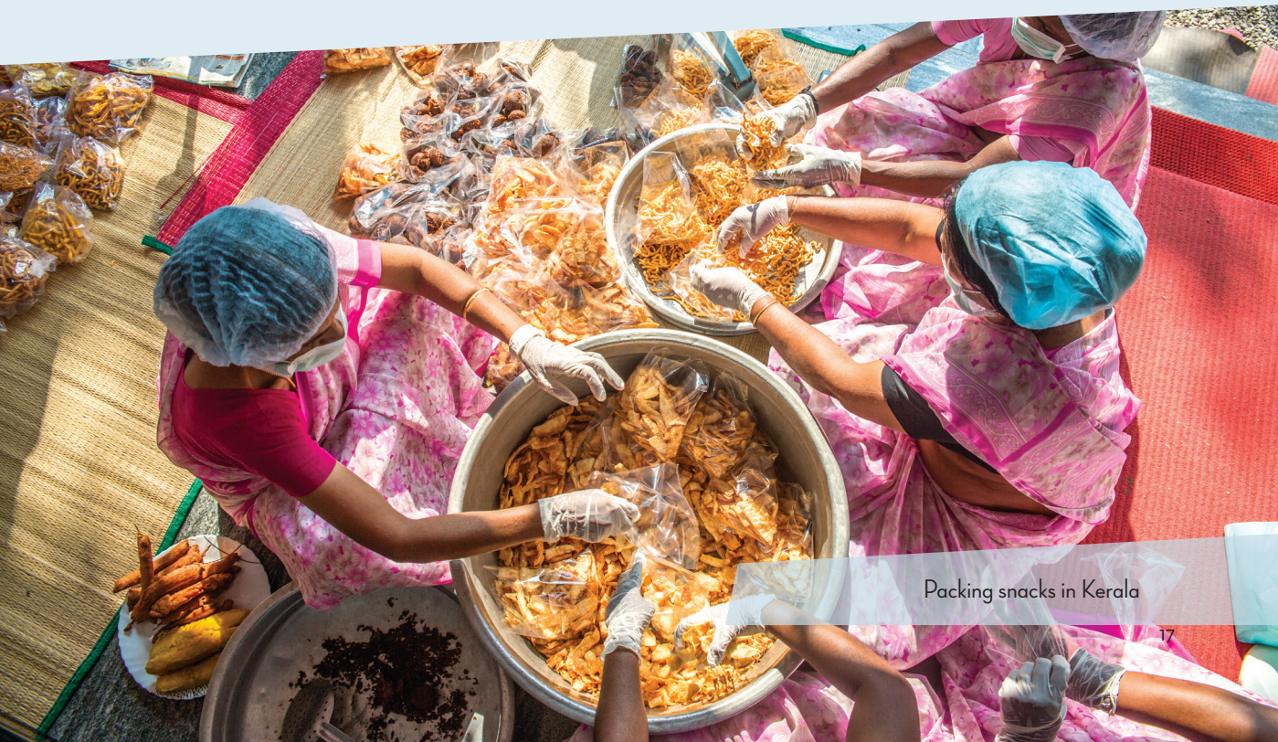
Packing snacks in Kerala

With the collaboration of international agencies like UNDEF (United Nations Democracy Fund), ILO (International Labour Organization) and in association with MSME (Ministry of Micro Small and Medium Enterprises), various trainings have been given.